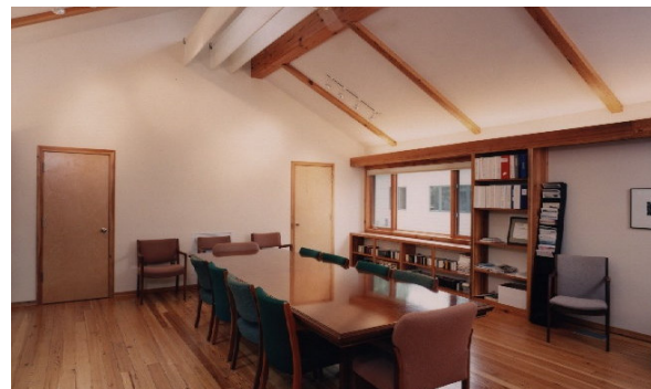
Conference room with South-facing clerestories for daylighting. Interior daylighting with supplemental energy-efficient lighting reduces long-term operating costs and improves indoor environmental quality.

In July 2002, once the facility had been operating for one full year, Ms. Ravetto benchmarked the new building's actual energy performance using EPA's online energy performance rating system. This rating compares the energy use of an existing building against a national database of similar facilities. RAFI-USA scored a 90 out of 100, distinguishing it as the first office building in North Carolina to earn the prestigious ENERGY STAR®. Annually, it consumes 25.1 kBtu/SF and costs $0.60/SF to operate. The architect and owner are delighted that the design energy target came very close to the building's actual energy use. By managing resources and implementing energy efficiency strategies, the RAFI building prevents the emission of 300,000 pounds of carbon dioxide, compared to an average facility. The environment benefits and so do the occupants.