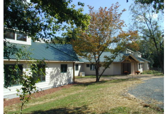
Dan Pollitt Conference Center — Southwest view. Effective building shape, location, and orientation optimize energy efficiency with increased daylighting and passive solar opportunities.

A full-day design charrette (brainstorming meeting) was conducted at RAFI's site in downtown Pittsboro. Participants included architects, engineers, RAFI staff and board members, municipal officials, and community leaders. They did a walk-through of the 2.8-acre site to analyze land features, and toured the 1830 two-story building to evaluate options for reusing the aged structure. Afterwards, they gathered under massive old oak trees and produced a list of priorities that became part of the building program.